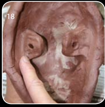
18. Add clay loops or holes to the back so you can run a wire across the back of the mask so it will hang on the wall.