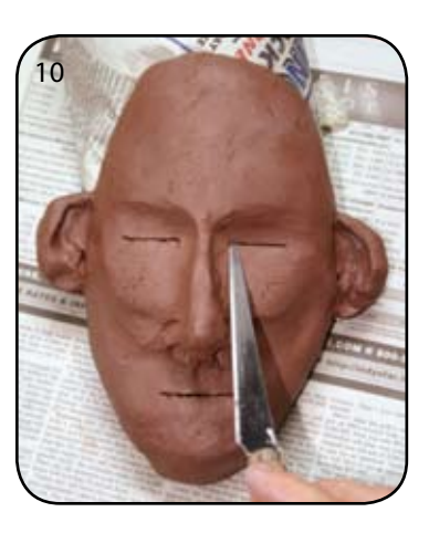
10. Take a fettling knife to cut straight lines through the clay horizontally across the middle of the eyes the size of an eyeball. At the middle of where the mouth should be, cut a horizontal line through the clay the length of the mouth.