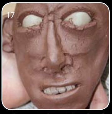
17. The teeth can be put in from behind and attached, making them as realistic or funny as you want. Tongues – cigars – pipes, etc. can add to the character of the piece.