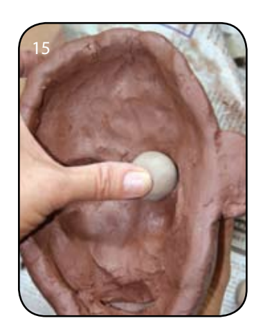
15. Take the white eyeballs and insert them one at a time into the opening of the eye from behind, pushing them into place and smoothing/attaching them on the back side of the mask into the red clay.