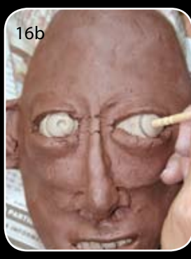
16. To finish the eyes use a round piece of plastic (top of a Sharpie marker works well) to define the iris. The pupil can be either carved out or another small round circle made with a pen part can be pressed into the clay.