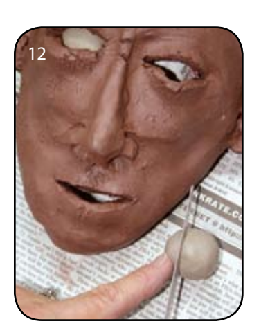
12. Wash the red clay from your hands.