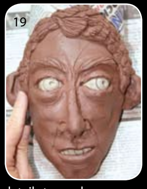
19. Add finishing details to mask.