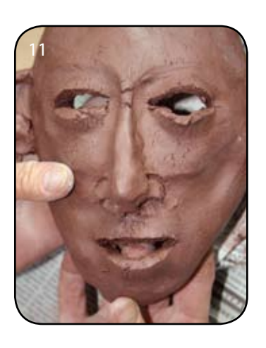
11. Once the lines are cut, turn the mask over and push out from behind in the middle of the cuts making space for the eyes and opening the mouth. The mouth may need some shaping and the lips may need some smoothing depending on the thickness of the clay.